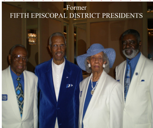
Former FIFTH EPISCOPAL DISTRICT PRESIDENTS

WHO TRANSITION FROM LABOR TO REWARD ON: SEPTEMBER 7, 2015