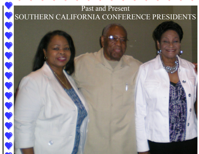
Past and Present SOUTHERN CALIFORNIA CONFERENCE PRESIDENTS

Christian Disciple Husband Father Granddad Servant Scholar Layman Officer Trustee Steward Usher Engineer Founder Builder Planner President Statesman